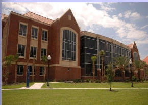
The newly renovated Library West.

New student library orientation sessions are scheduled several times at the beginning of the semester. You may also check out their “Just Getting Started” web guide at any time; visit http://www.uflib.ufl.edu/jgs/getstart.html .