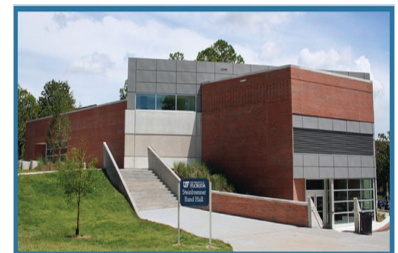
Steinbrenner Band Hall (dedicated November 2008)

Health insurance, sponsored through Student Government, is available for purchase for students not on a graduate assistantship. Call the Insurance Office of the Student Health Care Center at 352.392.1161 x284, or visit them online at http://www.shcc.ufl.edu/insurance.shtml .