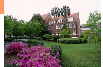
Student Health Care Center/Infirmary

copy of the proofs and the form that you submit, and bring those with you. If your records are incomplete for any reason, you will be able to acquire necessary immunizations once you arrive on campus. If you mailed or faxed records, or have special questions or concerns, you may call 352.392.1161, and press '3' to reach the Immunization Clinic.