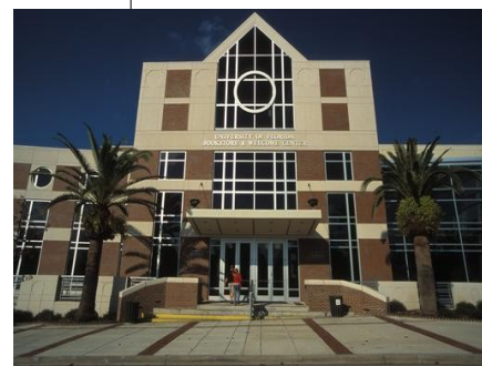
The UF Bookstore and Welcome Center at the J. Wayne Reitz Union