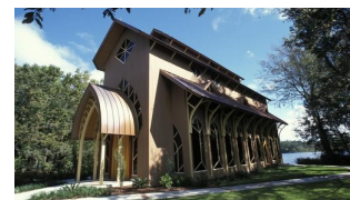
The Baughman Center, on the shore of Lake Alice

You should always seek financial aid advice from your assigned aid counselor, as requirements are complex and beyond the expertise of the college office. The key to a stress-free semester is to begin the semester with other funds (perhaps available credit that you can pay back when your aid is disbursed). To learn who your financial aid adviser is, visit http://www.sfa.ufl.edu/infoserv/adviser.html