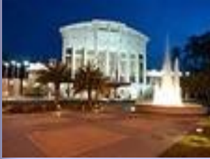
Curtis M. Phillips Center for the Performing Arts

Muse Magazine is a college-wide publication that provides information about recent activities of faculty, students, and staff of UF's College of Fine Arts. Launched in the spring of 2005, Muse is distributed to friends of the college. Link to it online at http://arts.ufl.edu/newsandevents/publications.aspx .