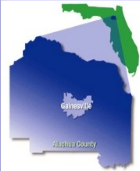
Gainesville: A Place for Living and Learning http://www.cityofgainesville.org

New student library orientation sessions are scheduled several times at the beginning of the semester. You may also check out their “Just Getting Started” web guide at any time; visit http://www.uflib.ufl.edu/jgs/getstart.html .