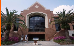
Criser Hall (Admissions; Registrar; Financial Services)