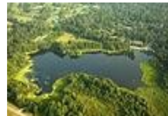
Lake Alice, in the heart of the UF campus

ISIS (Integrated Student Information System)