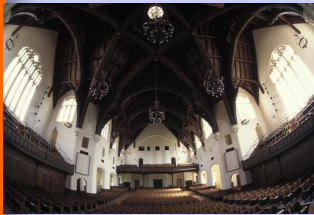
The interior of the University Auditorium, viewed from onstage—the Graduate Admissions office is located in the vestibule on the stage-right side of the Auditorium.

GatorLink is a computer ID and suite of services that allows access to a variety of UF campus computing resources. Every student is required to get a GatorLink ID.