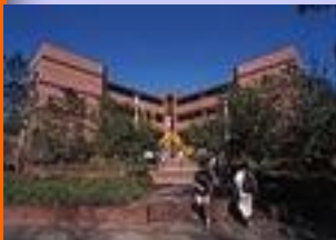
Computer Sciences and Engineering Building

Access to and ongoing use of a computer will be required for all students to complete their degree programs successfully. The University of Florida expects each student to acquire computer hardware and software appropriate to his or her degree program.