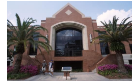
Criser Hall (Admissions; Registrar; Financial Services)

Office of Admissions S201 Criser Hall PO Box 114000 University of Florida Gainesville, FL 32611-4000