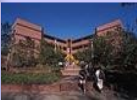
Computer Sciences and Engineering Building

For more information, visit http://www.gator1card.ufl.edu , or call 352.392.8343.