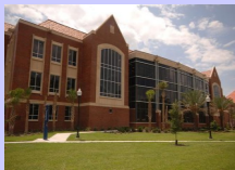
The newly renovated Library West.

New student library orientation sessions are scheduled several times at the beginning of the semester. You may also check out their “Just Getting Started” web guide at any time; visit http://www.uflib.ufl.edu/jgs/getstart.html .