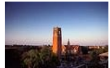
The Century Tower Carillon

The University Office of Admissions also provides information to help you become better acquainted with UF. Visit http://www.admissions.ufl.edu/grad/ and follow the links under "Admitted Students." A complete listing of Admissions sites is available at http://www.admissions.ufl.edu/sitemap.html .