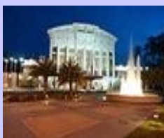
Curtis M. Phillips Center for the Performing Arts

Muse Magazine is a college-wide publication that provides information about recent activities of faculty, students, and staff of UF's College of Fine Arts. Launched in the spring of 2005, Muse is distributed to friends of the college. Link to it online at http://www.arts.ufl.edu/publications/publications.asp .