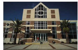
The UF Bookstore and Welcome Center at the J. Wayne Reitz Union