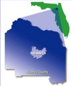
Gainesville: A Place for Living and Learning http://www.cityofgainesville.org

New student library orientation sessions are scheduled several times at the beginning of the semester. You may also check out their “Just Getting Started” web guide at any time; visit http://www.uflib.ufl.edu/jgs/getstart.html .