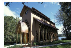
The Baughman Center, on the shore of Lake Alice

You should always seek financial aid advice from your assigned aid counselor, as requirements are complex and beyond the expertise of the college office. The key to a stress-free semester is to begin the semester with other funds (perhaps available credit that you can pay back when your aid is disbursed). To learn who your financial aid adviser is, visit http://www.sfa.ufl.edu/infoserv/adviser.html