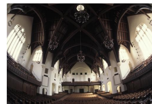
The interior of the University Auditorium, viewed from onstage

The UF Bookstore offers discount programs on Apple and Dell systems and software; for more information, visit their website at http://www.bsd.ufl.edu/bookstore/ .