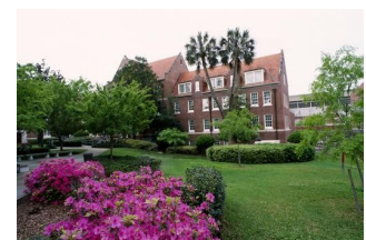
Student Health Care Center/ Infirmery