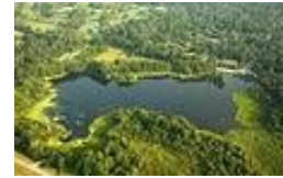
Lake Alice, in the heart of the UF campus