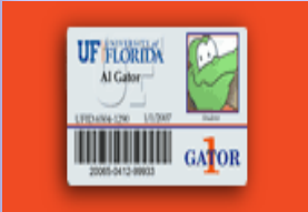
UF's Gator 1 Card

Students not on a graduate assistantship may also purchase health insurance sponsored through Student Government. Call the Insurance Office of the Student Health Care Center at 352.392.1161 x284, or visit them online at http://www.shcc.ufl.edu/insurance.shtml .