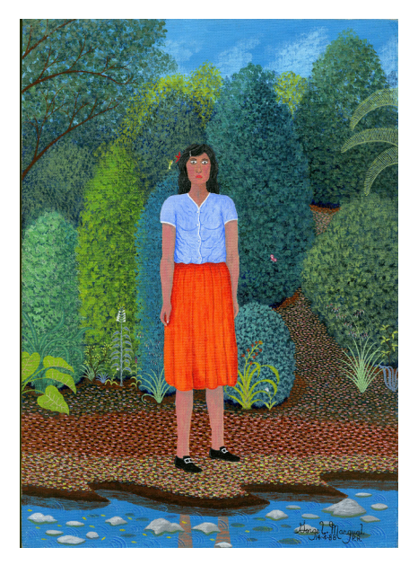
Gorge Mangual Untitled; Oil on Board; 10 x 14 inches; 1988

Luis Lasalle Powerful Hand; 15 x 8 x 4.75 inches; 1994 Florencio Cabán Powerful Hand; 9.25 x 5.5 x 3.25 inches; around 1910; Provenance: Jesús "Chucho" Rodriguez Collection