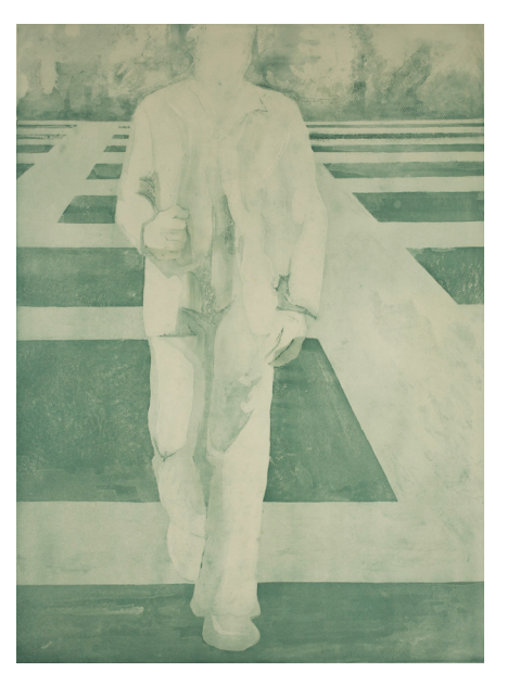
Myrna Baez Traje Blanco; Aquatint 8/50; 19.5 x 27.25 inches; 1978

José Luis Peña Burgos Powerful Hand; 21.75 x 12 x 6 inches; 1992 Pedro Pablo Rinaldi Jovet Powerful Hand; 13.5 x 5 x 4 inches; 1992 Anonymous Powerful Hand; late 19th century