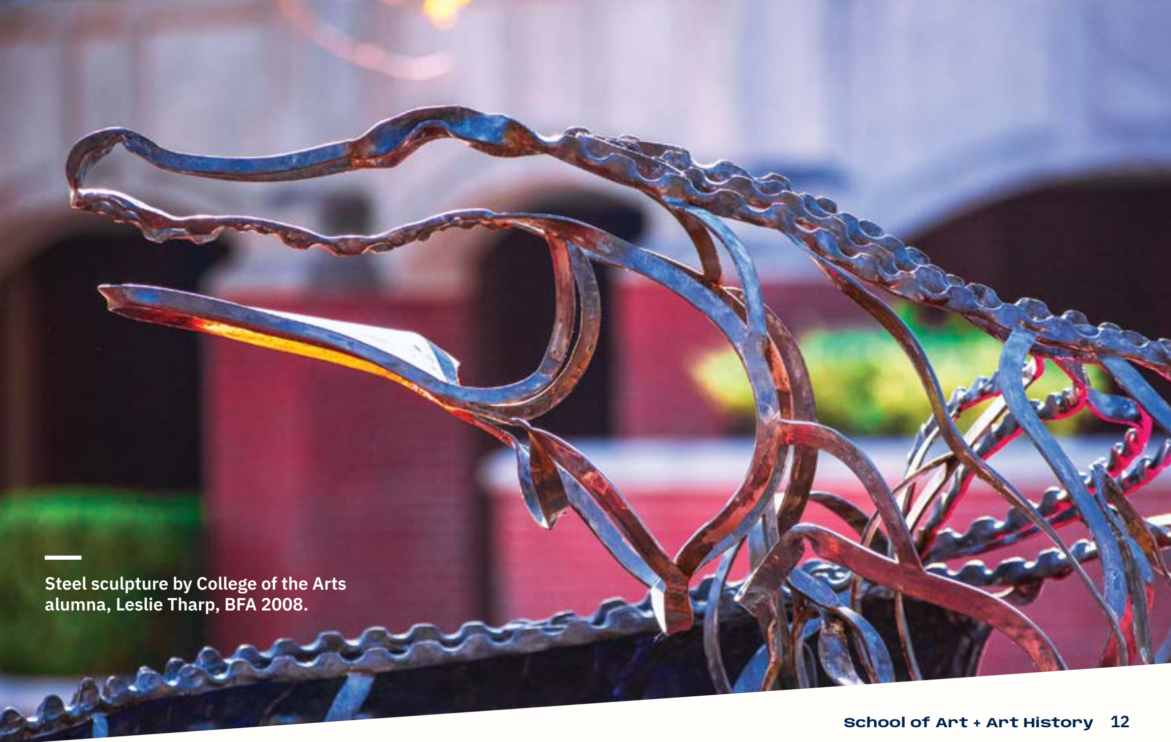
Steel sculpture by College of the Arts alumna, Leslie Tharp, BFA 2008.

The process of discovery is a vital aspect of developing your singular, creative voice. Nowhere is that more a part of your education than at the University of Florida College of the Arts.